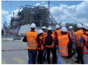
Vinci Construction : visite Musée de la Confluence 15 mai 2012

The Department of Civil Engineering and Urban Planning provides education in the scientific and technical fields of civil engineering and urban planning: